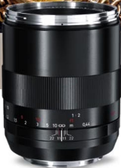
Picture shows ZE mount